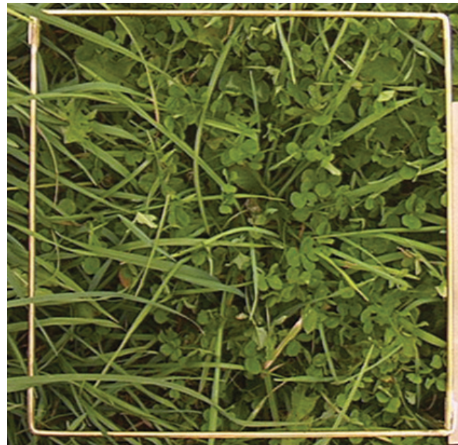
Figure 7. Sward containing 55% legume, 23% grass, 22% weeds, 7.0-inch canopy height, and 1677 lbs dry matter acre -1 forage mass.