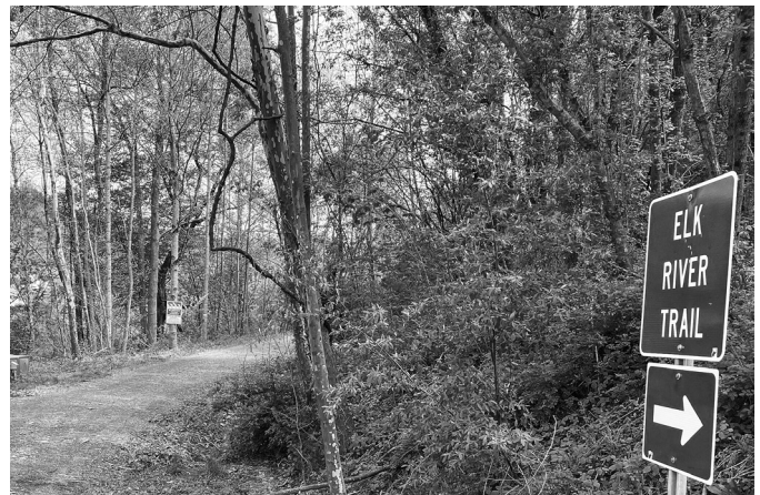
Elk River trail at Ivydale. The Elk River trail just north of the Ivydale road crossing.

In 2019, West Virginia Governor Jim Justice announced the newest addition to the state park system – the Elk River Trail System (ERTS). The ERTS spans three West Virginia counties, including Braxton, Clay and Kanawha. The rail trail, which will be operated by the Division of Natural Resources