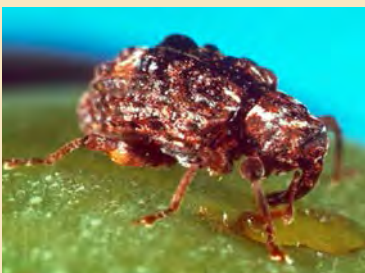
Figure 2. Adult plum curculio and feeding damage on plum.

Surface feeding and egg-laying by weevils can scar or deform fruit