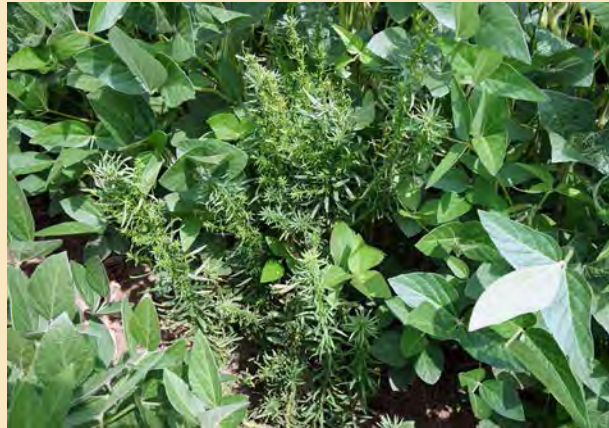
Figure 5. Horseweed ( Conyza canadensis ) resistant to glyphosate in a field with herbicide-tolerant soybeans.

Annual weeds with shorter life cycles develop resistance faster. Perennial weeds take longer time