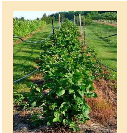
Figure 6. A well-pruned 'Apache' blackberry bed.

In order to improve the vigor of your hydrangea, remove some of the oldest shoots. The best blooms tend to be on the younger two-