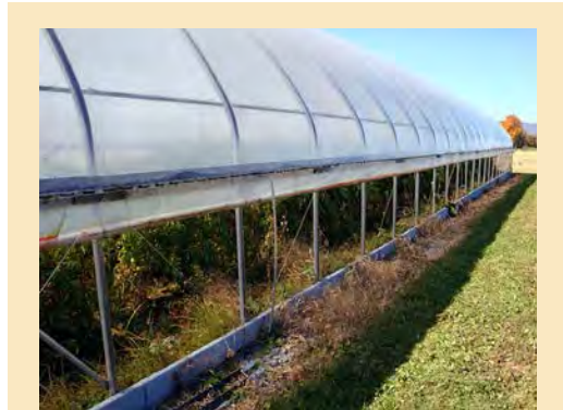
Figure 7. Weeds are a constant problem inside and outside of growing structures, because they compete with your crop for light, nutrients and water.

A vegetation-free strip should be maintained around the outside of your high tunnel. This will reduce the chance of weed seeds entering your production area and reduce sources for diseases and insects. Removing or mowing the vegetation are both good options,