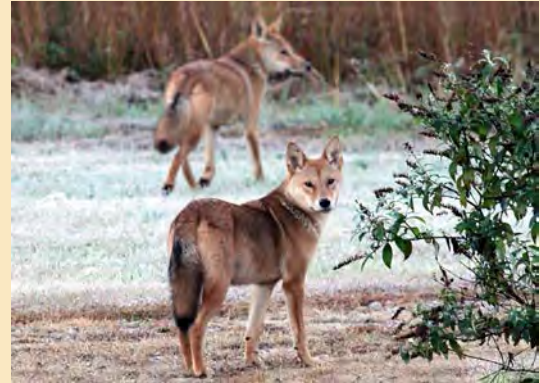
Figure 8. Records for the coyote in the mid-Atlantic states date back only 50 years.

West Virginia has an annual regulated trapping season where coyotes can be harvested, along with a continuous open hunting season on coyotes. Coyotes can even be hunted at night with artificial light or night vision technology during certain times