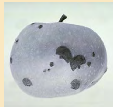
Figure 4. Plum curculio egg-laying damage on apple fruit.

Adult populations can be suppressed in the spring with well-timed applications of effective insecticides immediately after petal fall. Insecticides labeled for use against plum curculio and available for homeowners include carbaryl (Sevin), malathion and kaolin clay (Surround). Care should be taken when using carbaryl and malathion, because these products can be highly toxic to pollinators and beneficial insect predators, and may promote outbreaks of secondary pests (e.g., mites). In addition, care should be taken when using carbaryl in apples, because it can act as a fruit thinner when applied within two to three weeks after bloom. For organic growers, kaolin clay is a particle film that when applied to fruit and foliage helps discourage feeding and egg-laying.