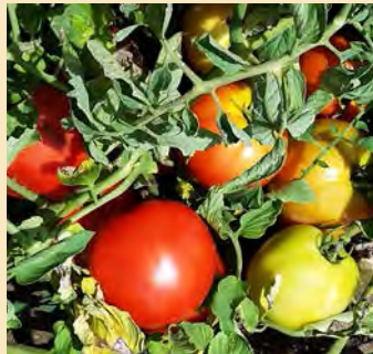
Figure 8. Newly released tomato variety.

Growers may also use bio-rational products, such as fixed copper (Kocide, Champ, Copper sulfate etc.), Regalia, Serenade or Actinovate, if rainy and cloudy weather persists for a long time. Considering the tolerance these lines possess, growers may not need any harsh chemicals for control.