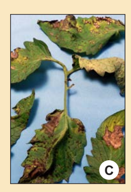
Septoria leaf spot: Spots with gray or tan centers and dark brown margins.