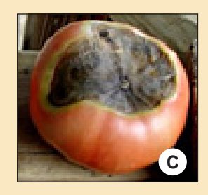
Black sunken areas on fruit