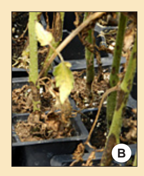
Black sunken lesions on stems