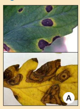
Early blight: Concentric rings with yellow halo.