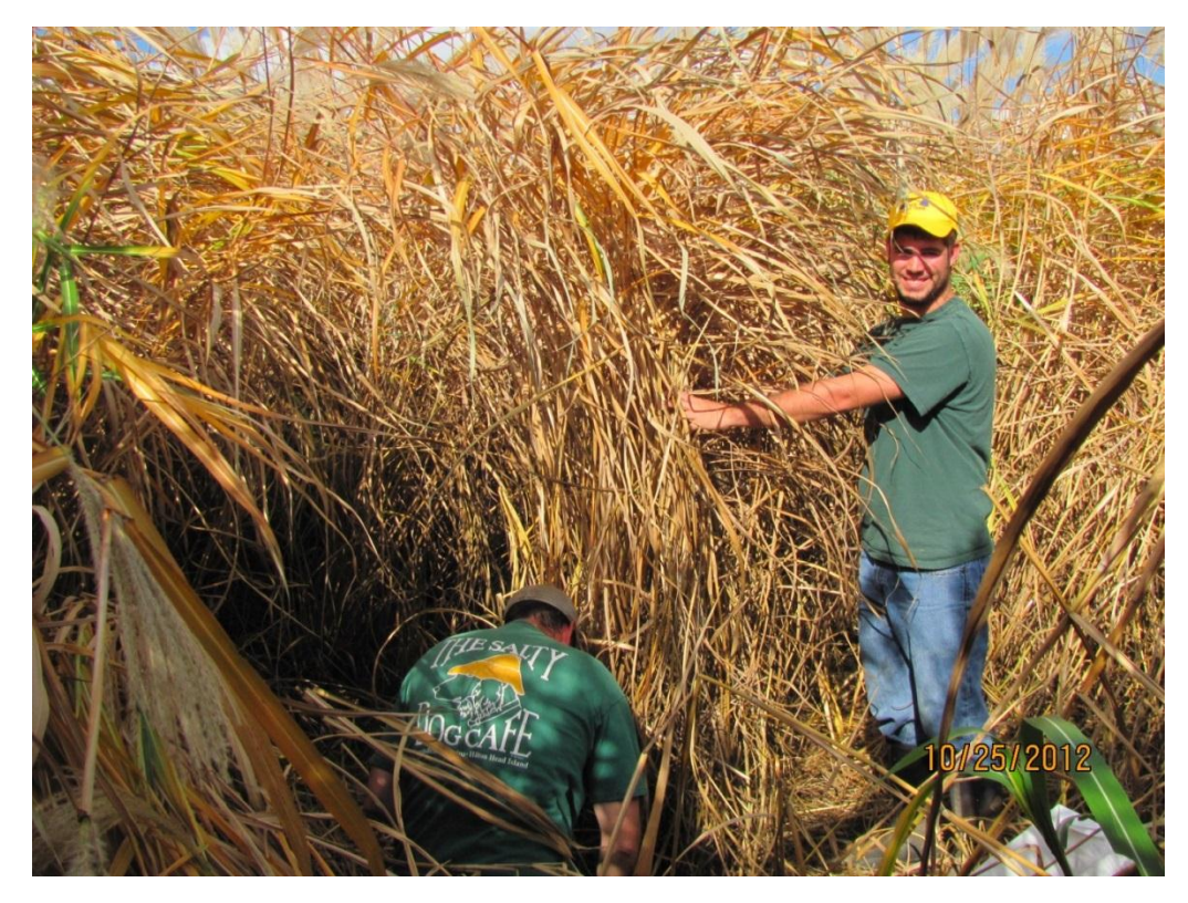
Picture 3. Clipping one plant of the private variety of miscanthus at Alton, WV, in 2012.

While yields were not quite at the 5,000 kg ha<sup>-1</sup> target level for economic feasibility established by the West Virginia Department of Environmental Protection, the target yield will likely be achieved in succeeding years. Weeds were found in appreciable quantities in the stands during the first and second years after planting, but they declined in 2012 as the switchgrass shaded and out-competed the weeds. Switchgrass stands do not develop fully until after the third growing season (Marra and Skousen, 2012). Therefore with less competition from weeds and greater stand density and growth, target yields are anticipated to be reached. These 25-yr-old soils have had organic matter additions from previous vegetation growth, and nutrient cycles have re-established in these soils which has helped to improve soil fertility for these low-maintenance grasses.