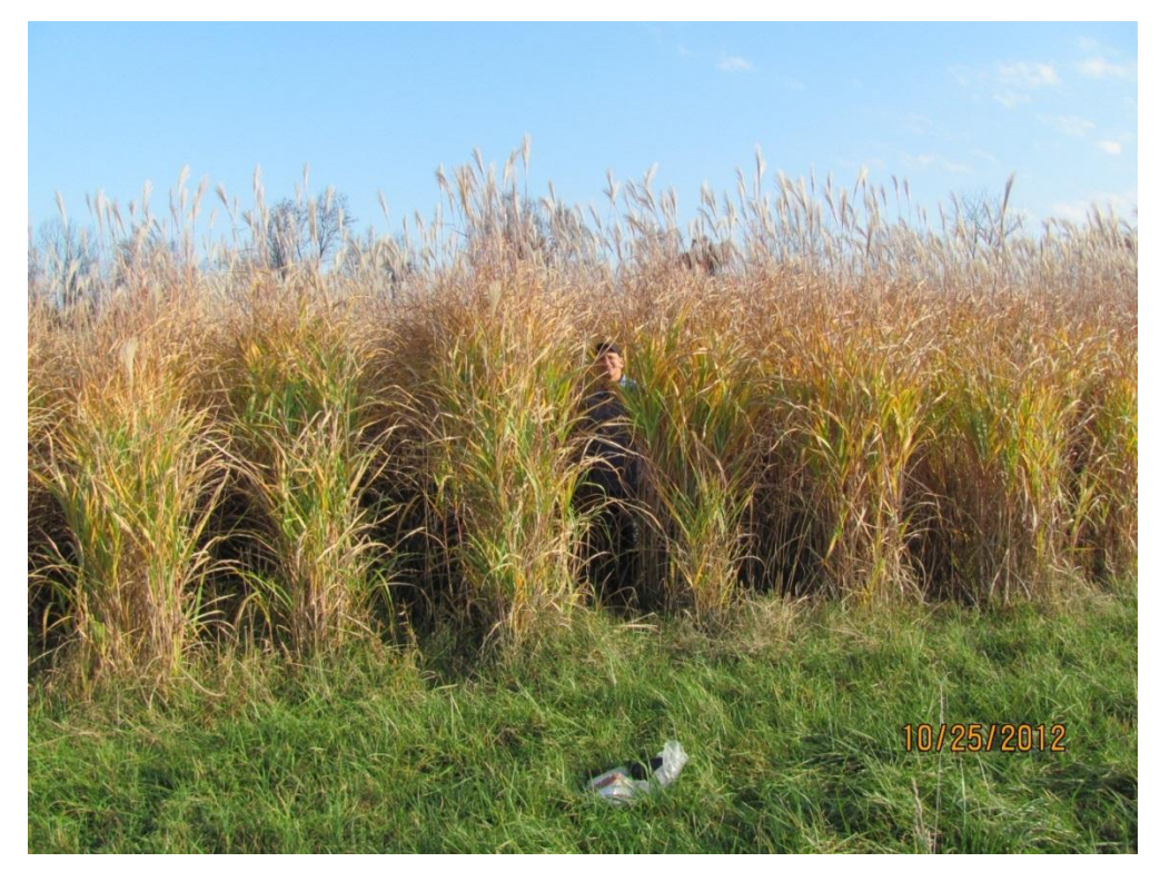
Picture 2. Tremendous growth of the private variety of miscanthus at Alton, WV, after the third growing season.

Picture 1. Growth of Kanlow switchgrass after the third growing season at Alton, WV.