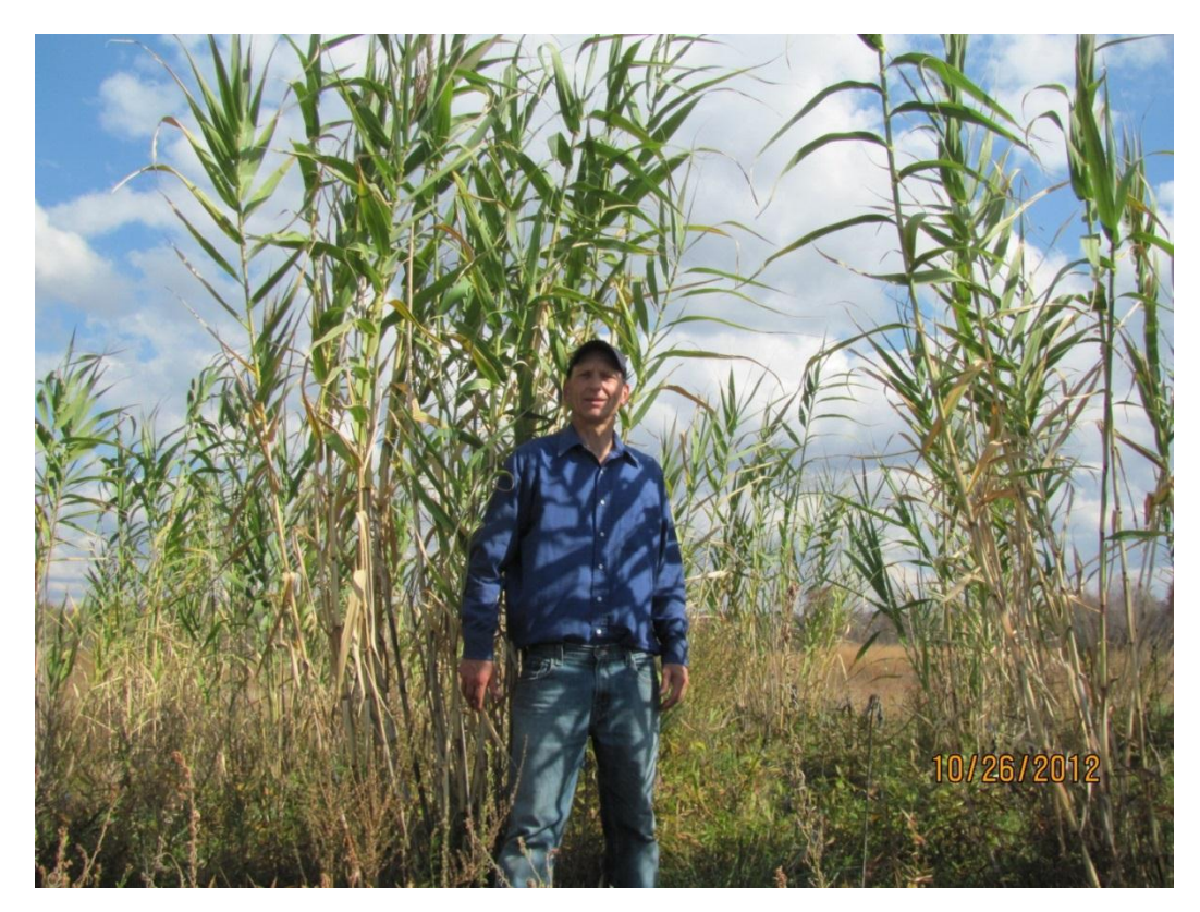
Picture 4. Sparse growth of giant cane at Alton, WV, after the third growing season.