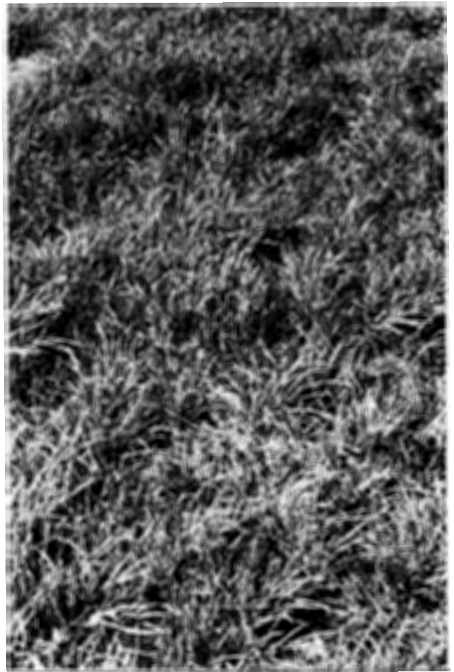
Figure 3. Variation in clumpiness of Potomac orchardgrass at West Virginia in the spring of 1962. The stand at left was fertilized at the high rate of nitrogen, and aftermath was cut to a 1½-inch stubble. The stand at right was fertilized at the low rate of nitrogen, and aftermath was cut to a 3½-inch stubble. Both stands were cut each spring at the early heading stage of growth.

nitrogen in conjunction with the high cutting height and still less clumping on plots fertilized at the low rate on nitrogen with either cutting height. It appears plausible to explain variation in clumpiness (Figure 3) on the relative amounts of competition among tillers and among plants. Nitrogen increases the vigor of orchardgrass tillers and thereby increases competition among tillers. Cutting close to the soil surface places stress on the tillers because no photosynthetic surface remains after cutting and a portion of the food reserves are removed. Therefore, tillers or plants which are least vigorous are further weakened or killed by the competition and crowded out by the more vigorous units. Clumpiness associated with high rates of nitrogen is not, however, limited to orchardgrass. Most perennial grasses grow in this manner at high rates of nitrogen.