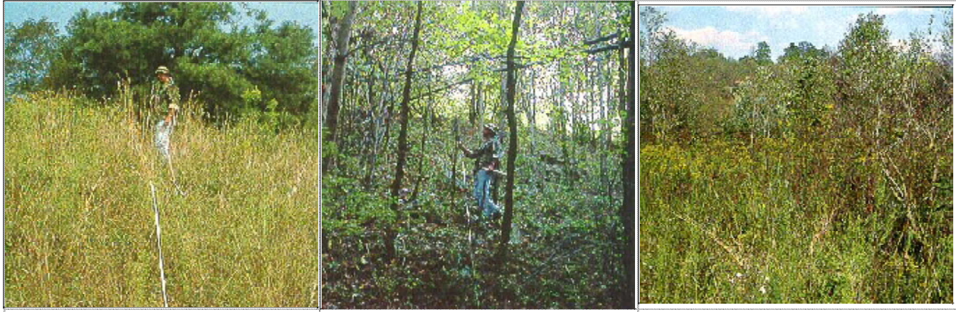
A flat top section on the Mynu site showing vigorous herbaceous cover and some trees in the background.

Part of the outslope area near our transect on the Mynu site.