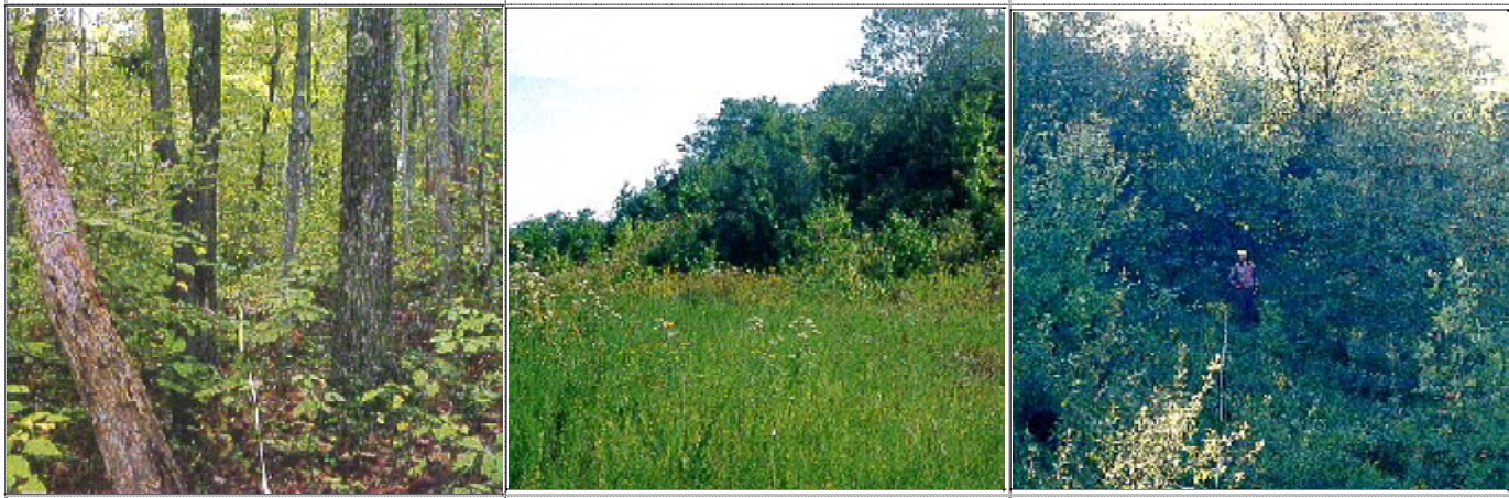
An undisturbed area adjacent to the Zapata mined site.

A flat top section on the Amherst site with diverse herbaceous cover.