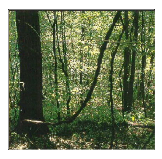
The undisturbed area adjacent to the Amherst mined area.